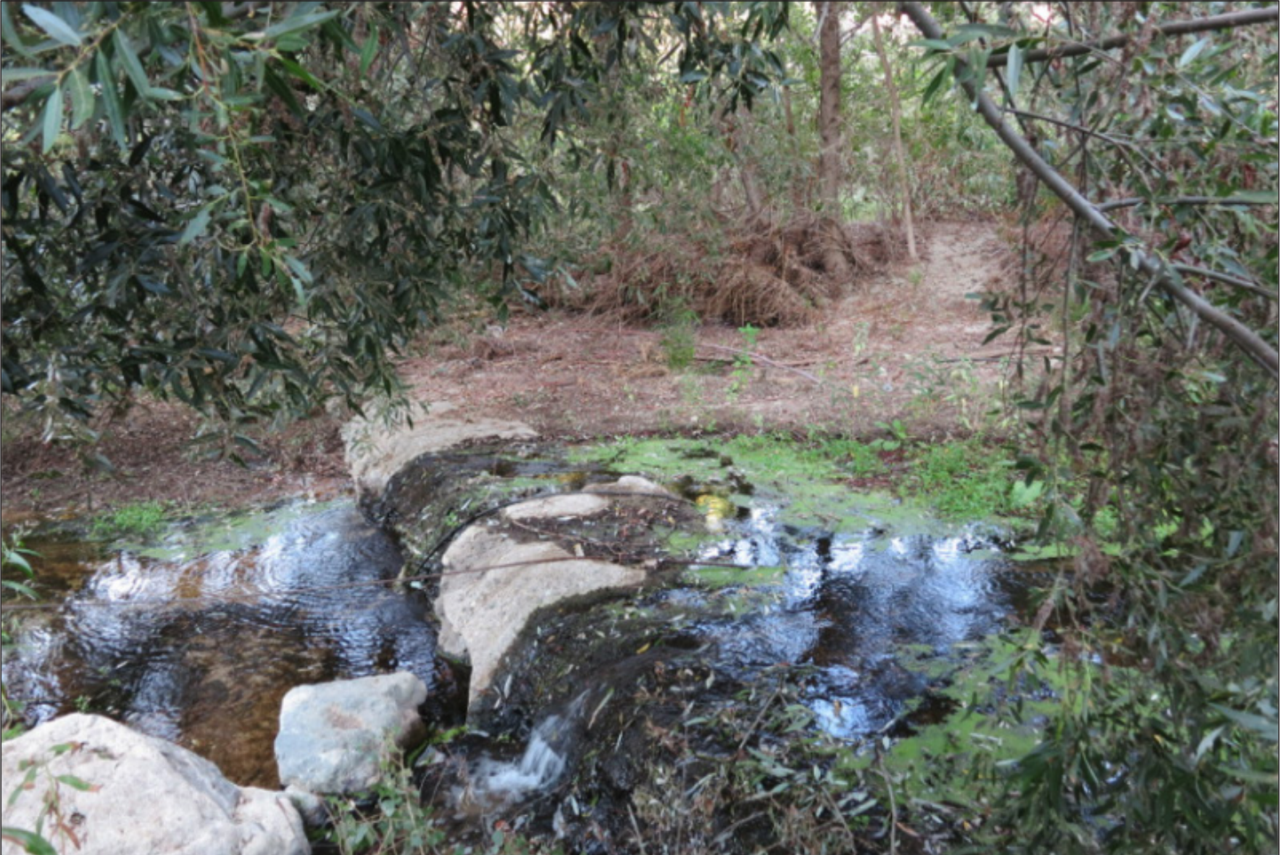
The Santa Clara River, home to the unarmored three-spined stickleback, not far upstream from the Newhall Ranch site, during the recent drought. The river's water level and surrounding vegetation vary dramatically with rainfall conditions.

Fully Protected Species Laws, Cal. Fish & Game Code Sec. 5515. They argue that catching stickleback is in itself an impermissible “take”, and note that in practice some would die in being caught. To plaintiffs, Sec. 5515 supplements the California Endangered Species Act (CESA) by adding additional protections for “fully protected” species.